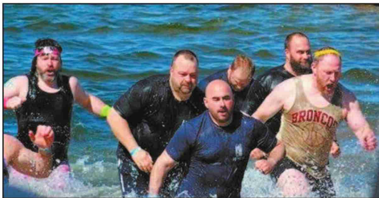
BELOW: Team Hudson exiting the 36-degree water of Lake Winnepesaukee on March 19.