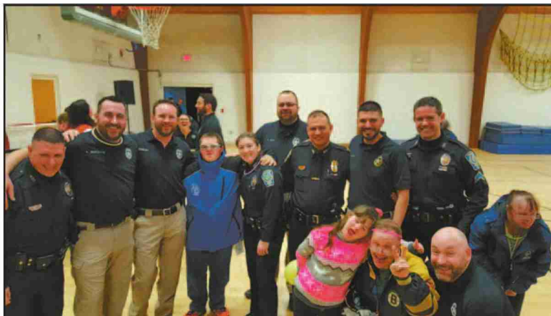
ABOVE: Team Hudson joins up with Team Nashua at the Special Olympics Winter Games.