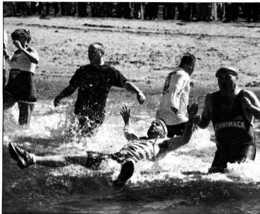
Team "Live, Freeze or Die" from the Merrimack Police Dept. made a splash during the 8th annual Winni Dip for Special Olympics at the Margate Beach on Saturday.