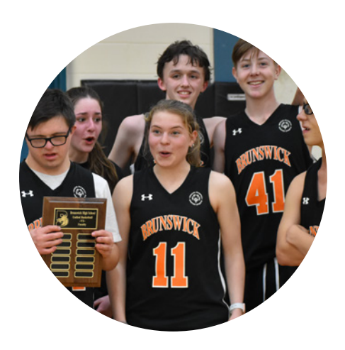
Brunswick High School uniforms : Play Unified roundel on left chest